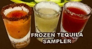
FROZEN TEQUILA SAMPLER