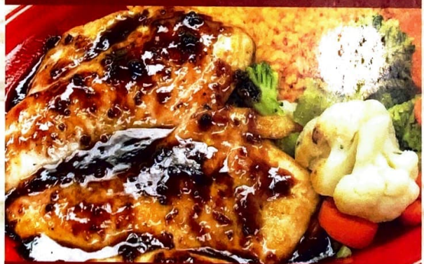
POLLO RASPBERRY CHIPOTLE