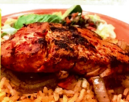
SALMON FILET A LA DIABLA