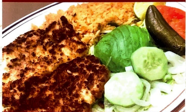
MILANESA DE POLLO