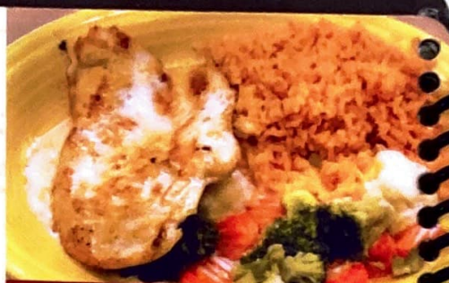
LUNCH POLLO SAN JOSÉ