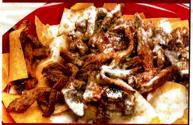
GRILLED STEAK NACHOS