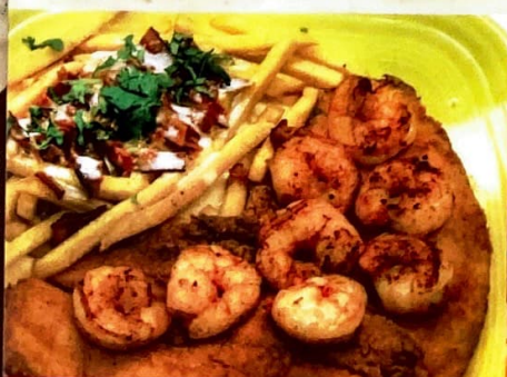
FISH DEL SUR