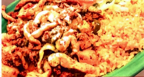
CHORIPOLLO SANTA FE

Breaded grilled chicken breast. Served with rice, avocado salad with cucumber, lime, jalapeño, purple onions and tortillas 13.95