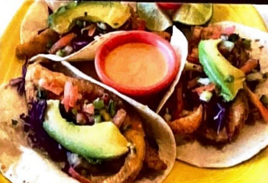
ENSENADA FISH TACOS