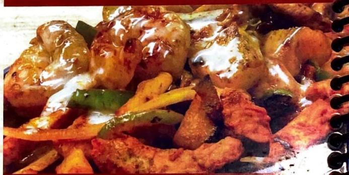
FAJITAS DEL MAR