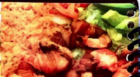
CAMARONES COSTA AZUL