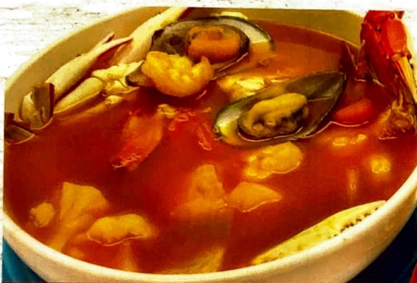
CALDO SIETE MARES

Fresh crab, shrimps, scallops, shell mussel, tilapia fillet cooked with cauliflower and carrots. Served with side rice, chopped onions, fresh cilantro, slices of lime and corn or flour tortillas 19.99