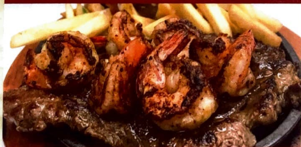
STEAK DEL NORTE