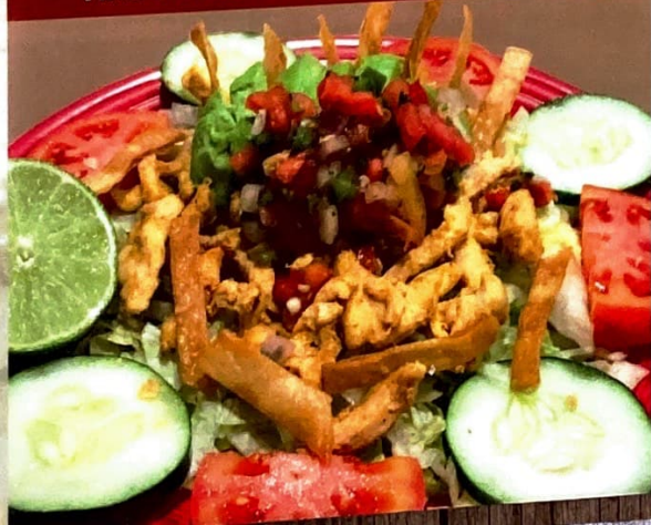
MARGARITA GRILLED CHICKEN SALAD

Margarita Grilled Chicken Salad Grilled chicken with lettuce, cucumbers, tomatoes, avocado slices, Pico de Gallo, tortillas bastones and lime 9.45